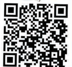
Career Services and Events