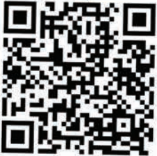
All Counties (Various Areas)

For more information or questions, please get in touch with Brooklyn Luelf at Blueluf@mscok.edu or call 580-319-0342