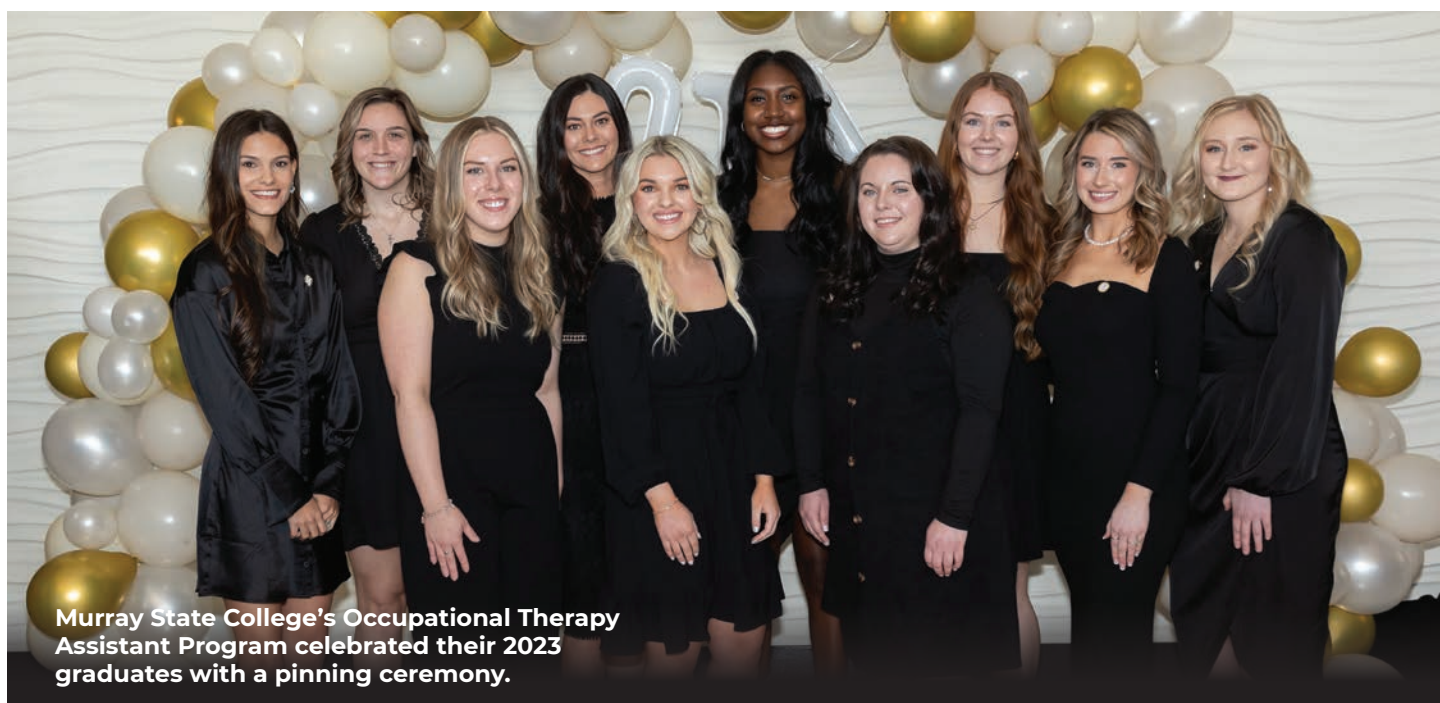
Murray State College's Occupational Therapy Assistant Program celebrated their 2023 graduates with a pinning ceremony.