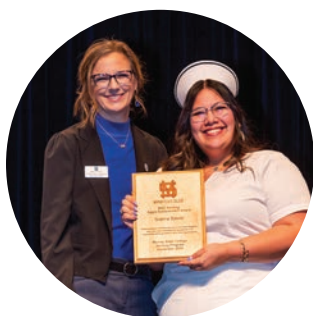
Sierra Davis Aggie Achievement Award