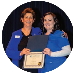
Kendra Land Citizenship Award