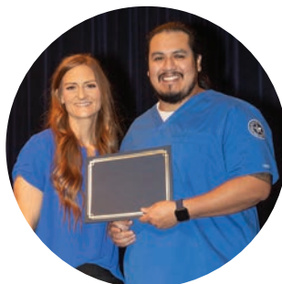
John Roca Academic Award