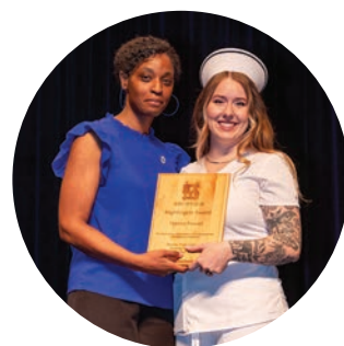
Hanna Powell Nightingale Award