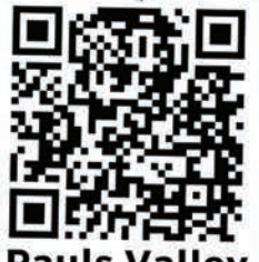
Pauls Valley Area