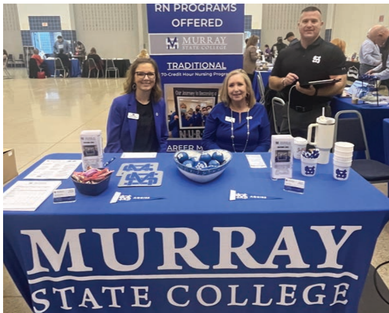
Murray State College attended the Michelin Resource Fair in January.

Murray State College is providing a scholarship opportunity to Michelin employees and their spouses and/or children who are interested in attending any programs. The scholarship covers tuition and some fees, and there are no restrictions on the program or the number of credit hours the student may enroll in. The scholarship fund is up to 1 million dollars and can be applied for once the student has been accepted to Murray State College. This opportunity is available on a first-come, first-served basis until the funds are depleted. Career Services are available for resume building, career exploration, and guidance on improving career paths (such as job shadowing, part-time/seasonal jobs, and internships). The Academic Resource Center provides academic, online/in-person tutors in Ardmore or Tishomingo, computers, printers, and Wi-Fi.