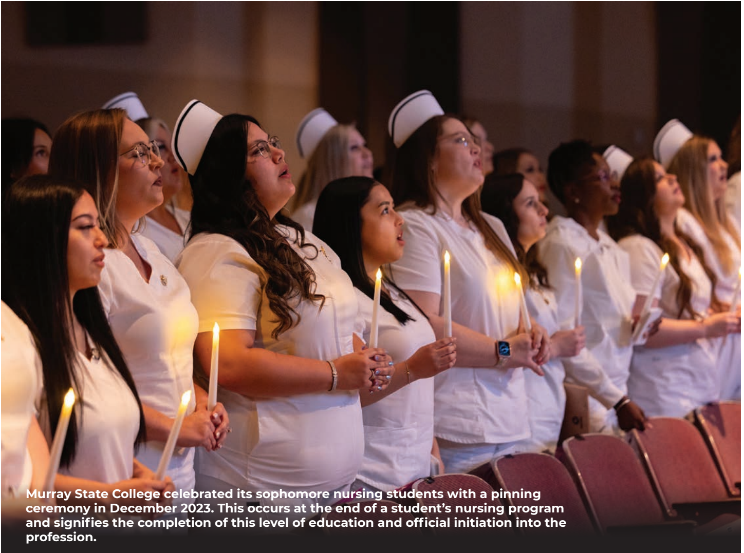
Murray State College celebrated its sophomore nursing students with a pinning ceremony in December 2023. This occurs at the end of a student's nursing program and signifies the completion of this level of education and official initiation into the profession.