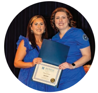
Morgan Copeland Clinical Award